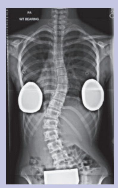
Photo 4: When this patient was referred to Gillette, she had a 46-degree left thoracolumbar curve with rotation.

Because of the severity of her scoliosis, the fact that she had growth potential remaining, and the strong likelihood that the curve would continue to progress into adulthood, spinal fusion surgery was recom-mended, and a limited anterior spinal fusion surgery from T-12 to L2 was performed. She tolerated the surgery well and has done well during her convalescence. (See Photo 5, below.) Although she required surgery, this case study demonstrates the importance of early identification and treatment.