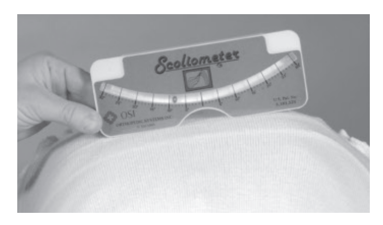
Photo 3: In this photograph, the scoliometer shows the patient's angle of trunk rotation measuring 8 degrees.

Examine skeletally immature patients with mild to moderate curves (10 to 25 degrees) every four to six months during growth. In skeletally immature patients with curves from 25 to 40 degrees, consider bracing with either a thoracolumbosacral orthosis (TLSO) or a cervicothoracolumbosacral (CTLSO) orthosis to prevent progression. At Gillette, custom orthotics are most often prescribed. Bracing does not cure scoliosis. Spinal fusion surgery is indicated for severe curves (those measuring greater than 45 degrees).