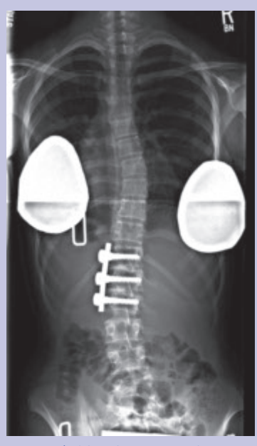
Photo 5: This film, taken following spinal surgery, shows improved spinal alignment.