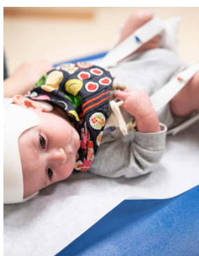
Developmental dysplasia of hip