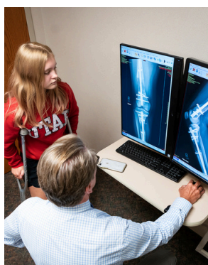
Limb length discrepancy