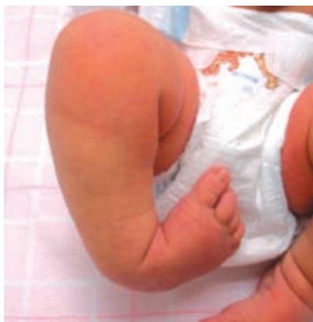
Infant with right clubfoot. Note the inverted position and the "upside-down" appearance of the foot.