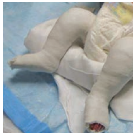
Infant with bilateral clubfeet undergoing Ponseti casting. Patient still has equinus of the feet, which is the last component to be corrected.