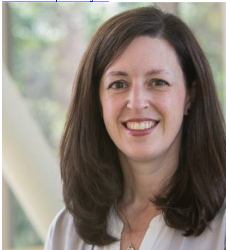
Pediatric Orthopedic Surgeon