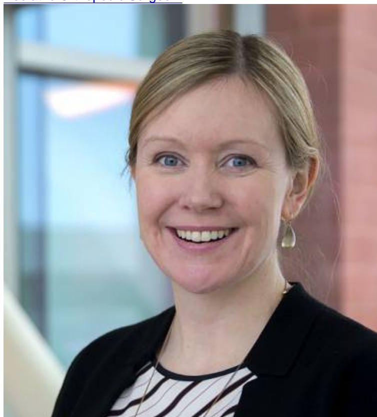
Pediatric Orthopedic Surgeon