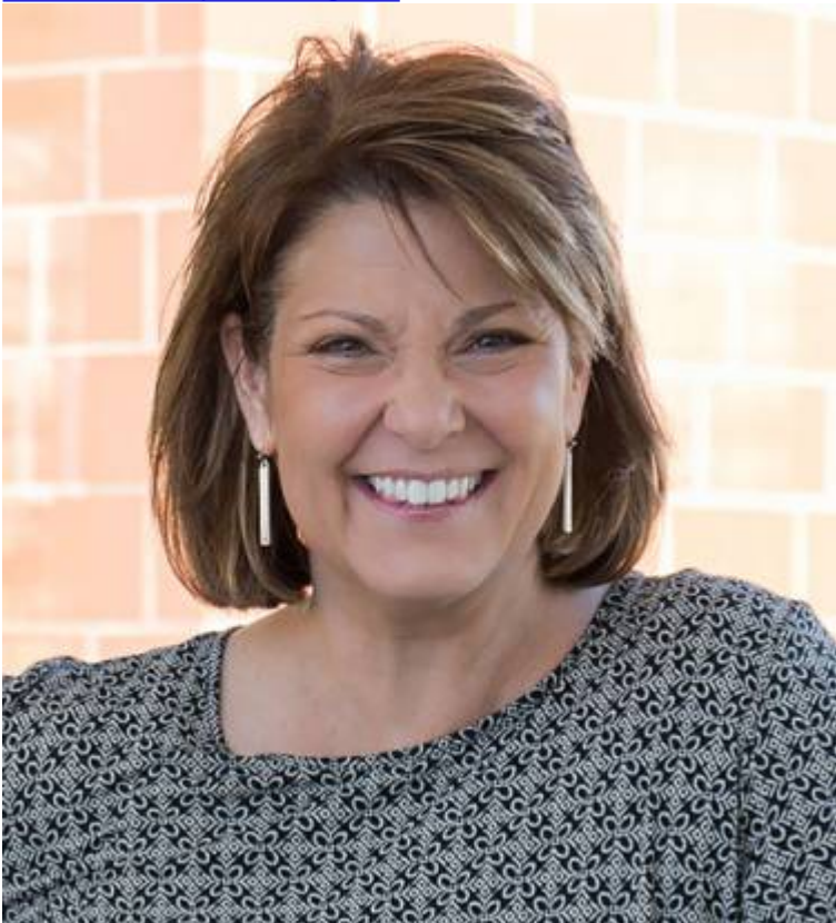
Pediatric Orthopedic Surgeon