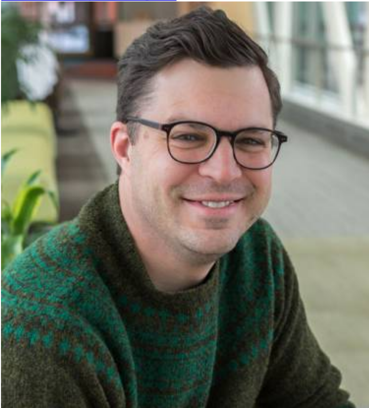
Pediatric Orthopedic Surgeon