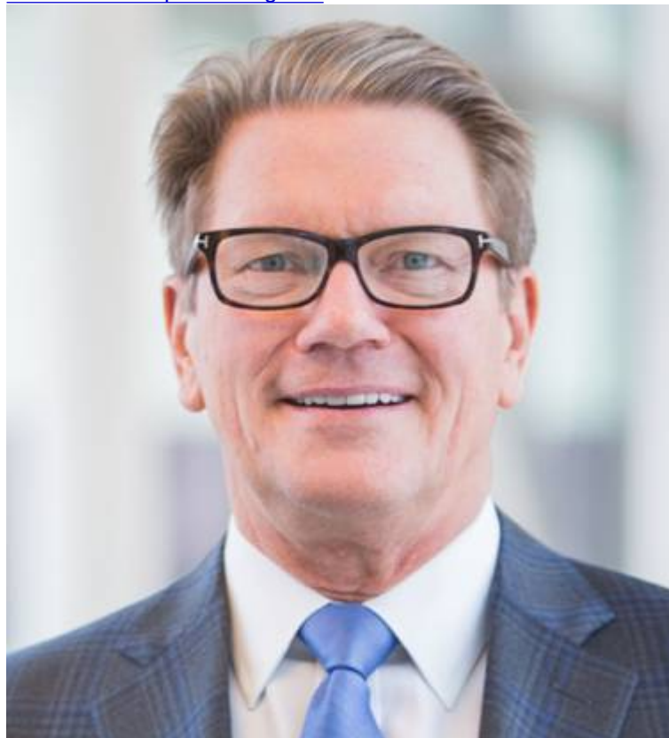
Pediatric Orthopedic Surgeon