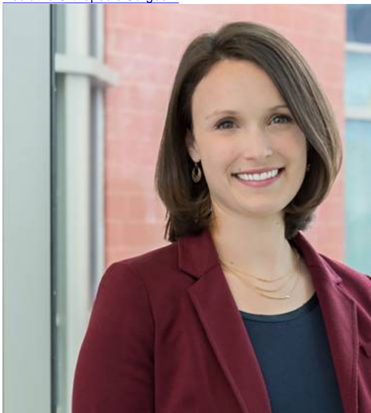
Pediatric Orthopedic Surgeon