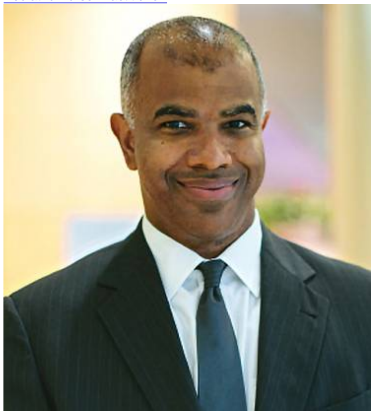
Pediatric Nurse Practitioner