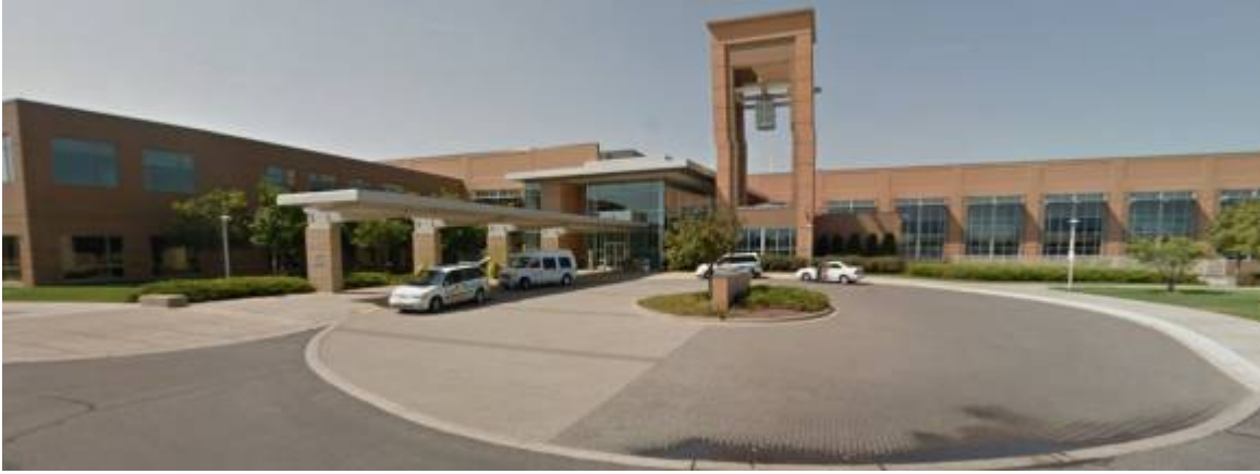
St. Cloud Clinic