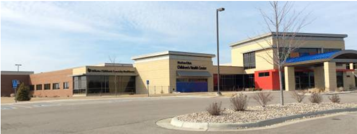
Gillette Mankato Clinic