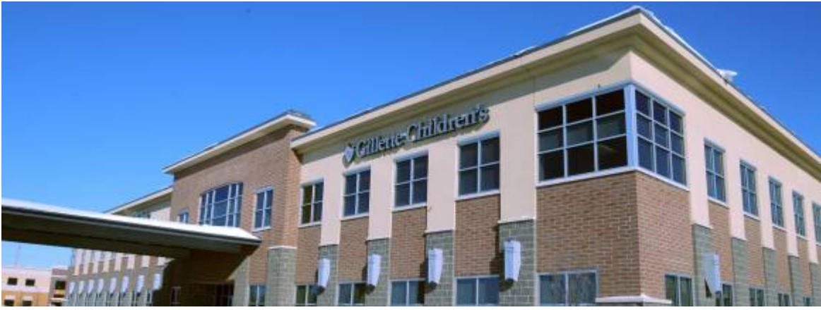
Maple Grove Clinic