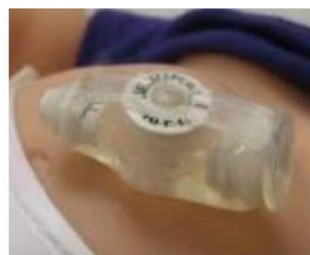
Avanos Mickey GJ Button

This information is for educational purposes only. It is not intended to replace the advice of your health care providers. If you have any questions, talk with your doctor or others on your health care team.